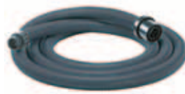
Vacuum Hose 4M W/ Bayonet Adaptor