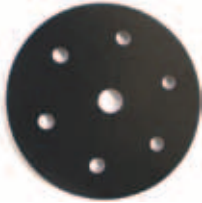
Hook & Loop Sponge Pad