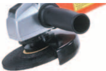
Guard (Optional) (EP5W only) Wheel (not incl.)